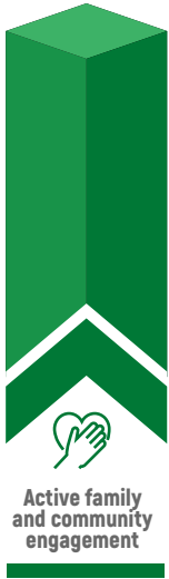
Active family and community engagement

To achieve better student outcomes, the Prichard Committee will seek to embed the community schools' four pillars, which are tailored to local contexts & evidence based.