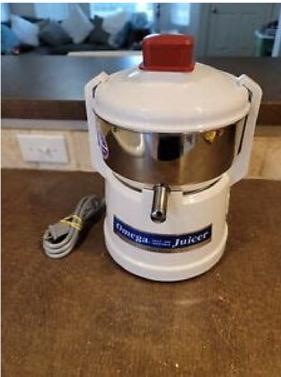
Omega juicer setup.

If they are not connected correctly, something is wrong in this step. Step: 3 - Place the snail in the right place. yizucenalutojo The B'omega juicer is easy to use and reliable for juice lovers. After purchasing a new Omega Juice press, you need to assemble its parts in order to begin pressing. Unfortunately, many people cannot understand the assembly process even after reading the manual. That's why there are complete instructions for building Omega Juice presses perfectly. There is no need to use an additional tool to position the Omega Juice Press. First you need to know the details and their exact location. Then simply insert one detail at a time to complete the assembly process. The assembly begins with the motor base and ends with the juice cover. However, one can deny the importance of knowing the process of building omega juice. rojiranakotubo A bad attempt during assembly can damage any part of the Omega Juice. Let's get straight into the main discussion. How you should give Omega Farmers like a pro, this section reveals everything about how exactly to give Omega Farmers. There are different types of omega juice and their composition is not similar. Simply follow the steps given here to prepare your juicer. Vertical Omega Juice Juicing Process Here is the complex assembly process of vertical omega juice. Step: 1. The top of the screen should be placed under the grooves.