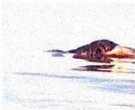
The alleged monster and its possible eye (wtn)

2 November Daily Telegraph but some research shows that this creature has been seen before. The short Vano Monster Lake video may have been filmed in 1997 by Unal Kozak, an assistant professor at the University of Van. This controversial video confused researchers when it came to identifying the creature in the video. Some claim to have seen the beak; Others seem convinced it's nothing more than a swimming elephant (although elephants don't live by the lake), and skeptics want to see nothing more than a pile of garbage bags that have been watered down deep. The film was shown on CNN in 1997 in the late 1800s and has since become the center of a storm of cryptozoological controversy. The Turkish scientific community cannot explain the identity and origin of the animal, and Orhan Erman, professor of biology at Ataturus University, claims that there is nothing like the Lake Van monster that can live in the lake. "After" being the size we saw, you just couldn't live in an enclosed lake like a van. " Like Van, it's a lake of soda, so no one can live here. Possible explanations for these sightings include ancient creatures like Plesa or Mosaur, or even squid, which some have never confirmed.B'welche crypt? Click here to take the quiz.