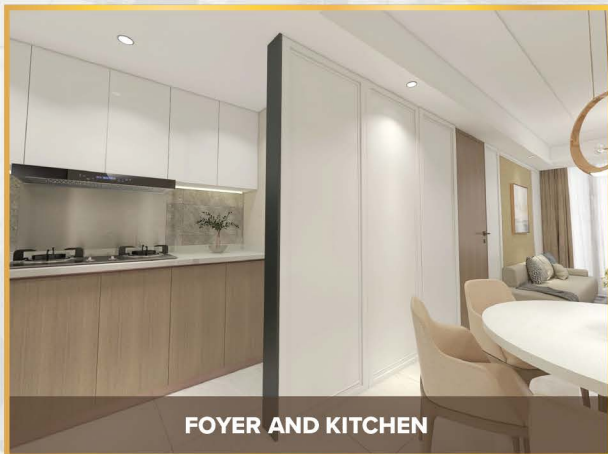
FOYER AND KITCHEN