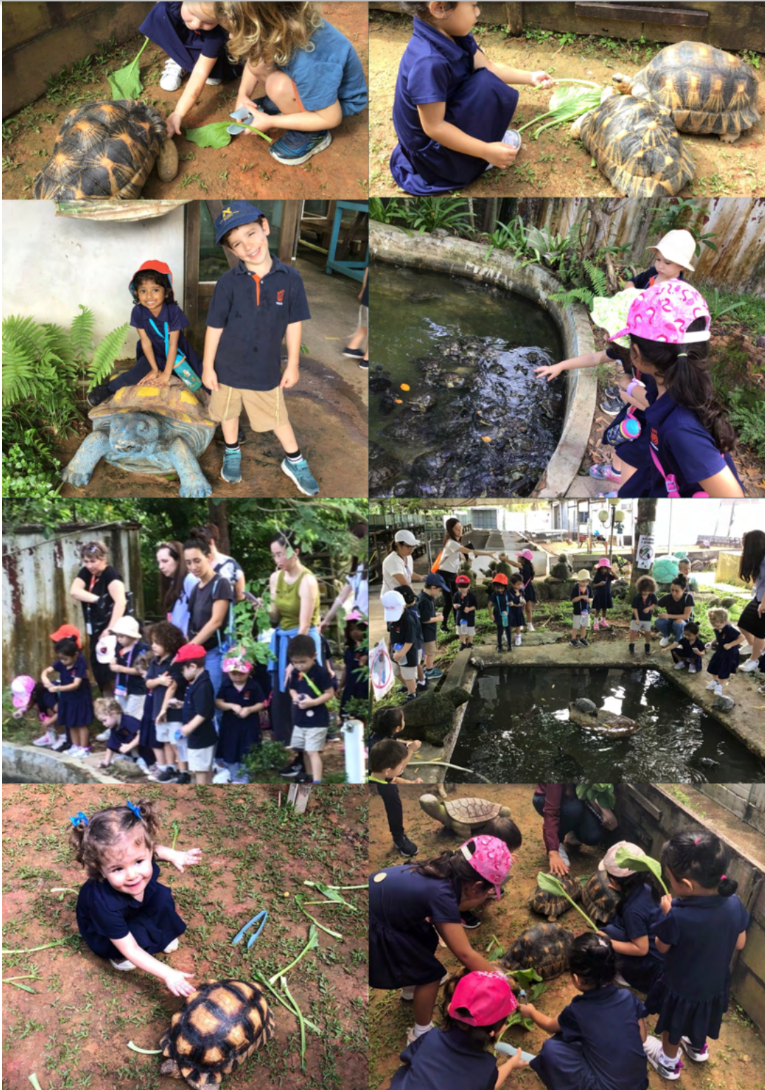
Pre-School Field Trip to The Live Turtle & Tortoise Museum