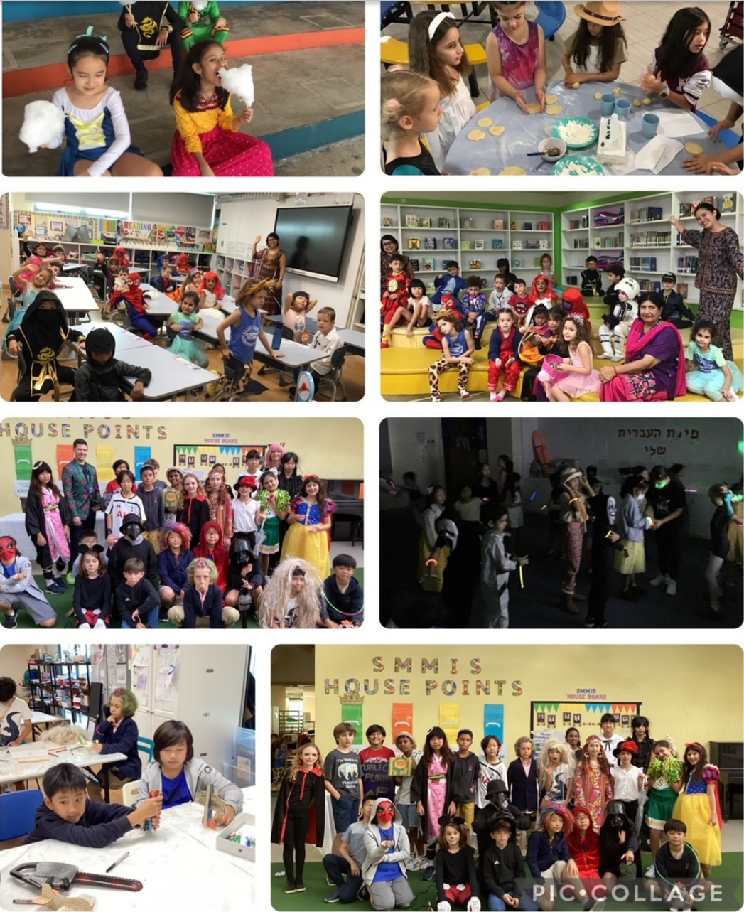
SMMIS Purim Carnival