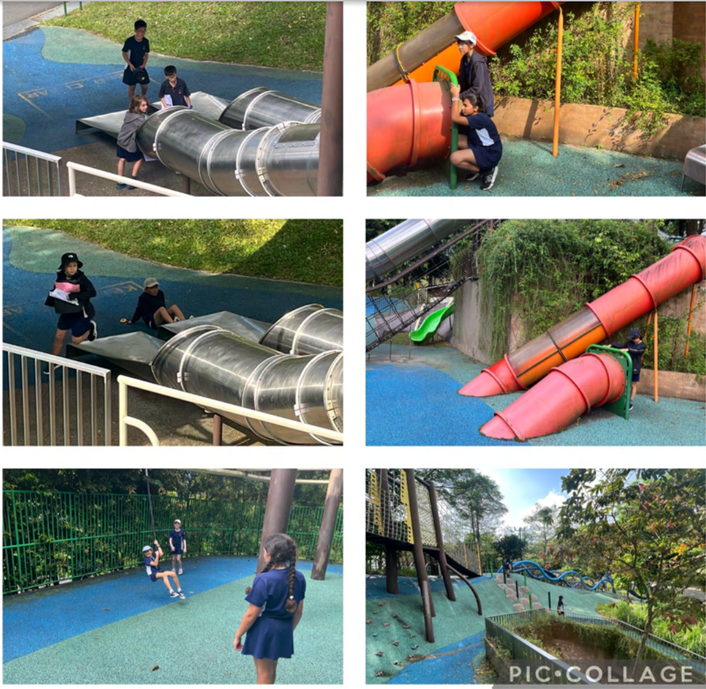
G5 Field Trip to Admiralty Park