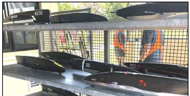
Carbon Fiber is the new black! (Continued on the next page)