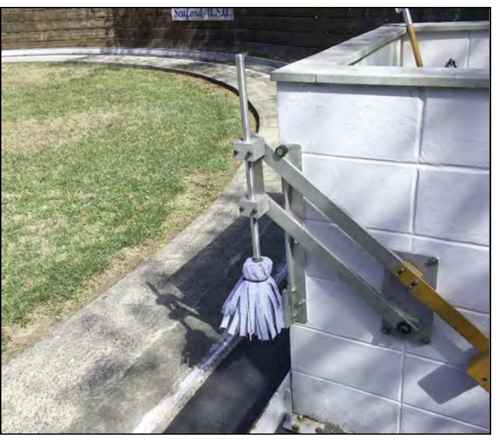
The shut-off broom has been updated and works beautifully.