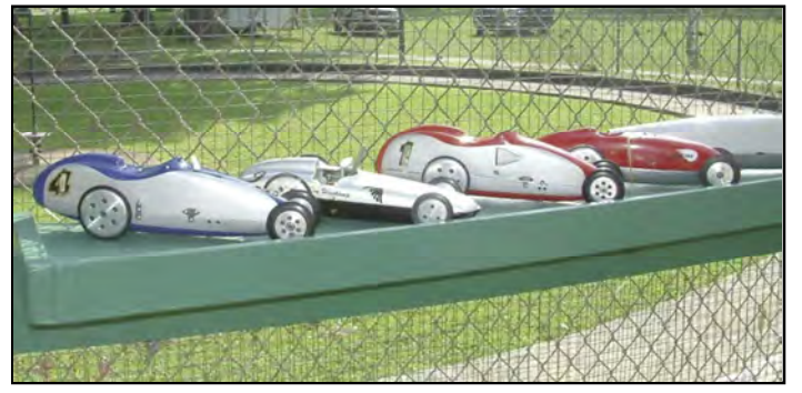
Some of Ron Hesskamp's stable of cars.