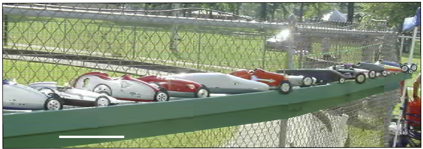
Some of the cars ready to run at Anderson.