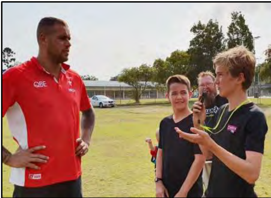
Will and Asher (The Sound Surfers) with Sydney Swan, Lance 'Buddy' Franklin

17x 30 sec spots x Zone 1 + 41 x 30 sec spots x Zone 2 $1,620.00 Bonus 12 x 30-sec spots Zone 2