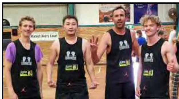
The 104.1 CHY FM Knuckleheads competing at the 3x3 Hustle Ball For Domestic Violence