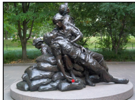
The Vietnam War Memorial