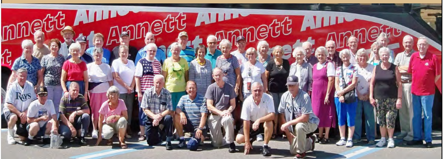
Tampa Bay Rays vs Boston Red Sox – Rays Won!! 8 - 4 – Forty Three Attended the Game. .....