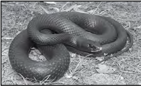
Black Racer Snake-Southern US

How’s your snake recognition – identification? You may find that it is pretty tricky to specifically identify the black species of Florida. Snakes can have many different colors. The following article has been selected so that you can, at least, have a little knowledge about the local visitors that slither in and out of our yards and sometimes into our homes and work areas. Much of the article has been left out because of space. The entire article and other materials can be found at https://edis.ifas.ufl.edu/uw251 . This article was copied.