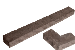
SILLS, CORNERS & ACCESSORIES