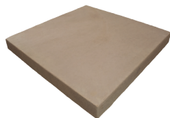
42" SUPER PAVER