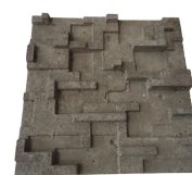
BIO-ACTIVE WALL TILES