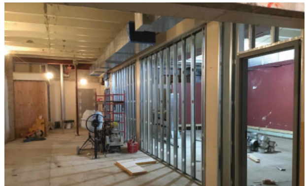
6) A view at the end of the corridor from the new entrance, toward the bottom of the stairs outside the sanctuary, which are behind the plywood wall. The children's gathering area is in the center, the children's office in the back, and a multi-purpose room is to the right.