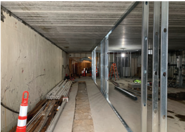
5) A view near the bottom of the stairs from the new entrance down the corridor leading to the stairs outside the sanctuary. The youth room is under construction on the right.