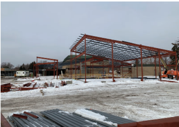
3) A view from Portland Avenue of front door straight ahead, the multi-purpose room to the right, and the gathering space beyond.