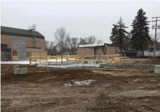
1) The footings, foundation, waterproofing, backfilling, and compacting were completed only hours before the first significant snowfall and subzero temperatures of the season.