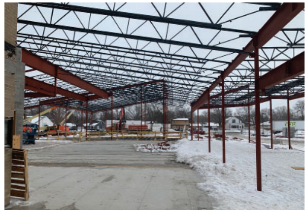
4) A view from outside the sanctuary, near the stair to the lower level, of the gathering space ahead, the multi-purpose room beyond, and a bank of rooms to the right, consisting of the nursery, restrooms, café, and front entrance.