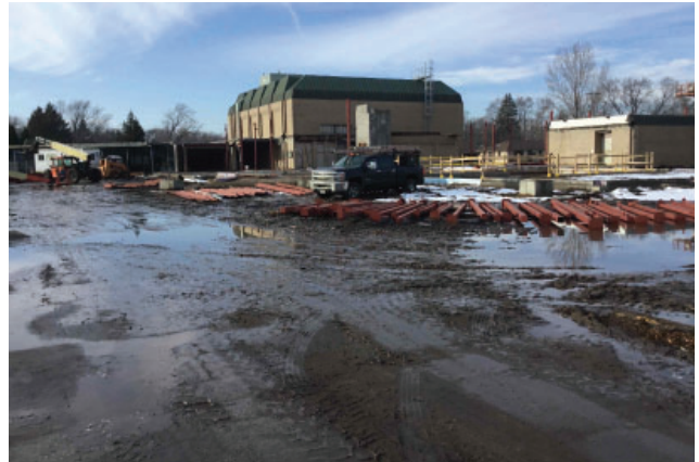
2) The steel organized and beginning to go up.