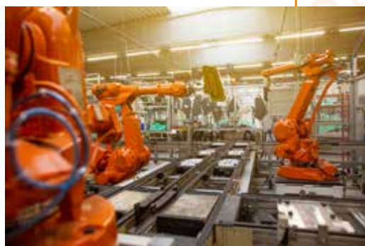
Other Industrial Sectors