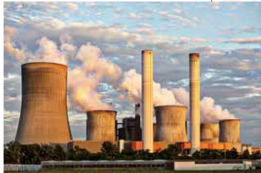
Power & Energy