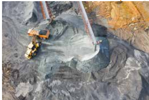
Mining & Minerals