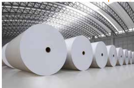
Pulp & Paper