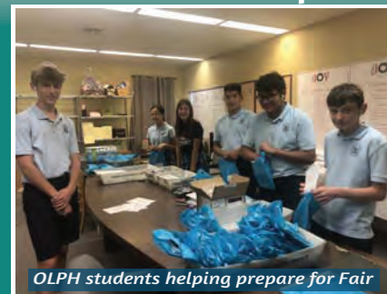
OLPH students helping prepare for Fair