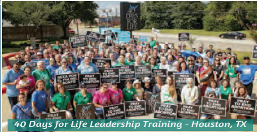
40 Days for Life Leadership Training - Houston, TX