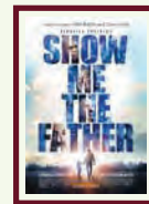
"Show Me The Father"