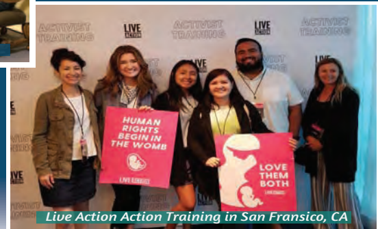
Live Action Action Training in San Francisco, CA