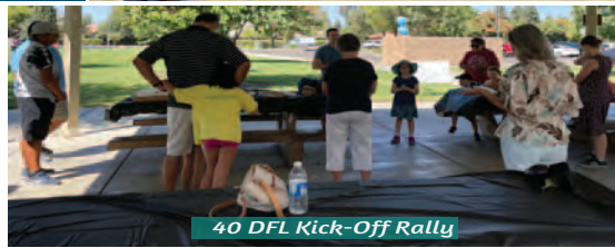
40 DFL Kick-Off Rally