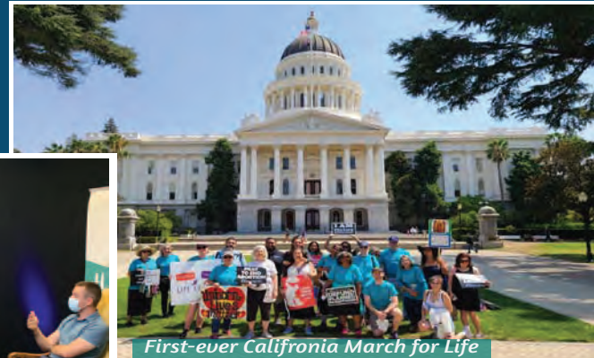
First-ever California March for Life