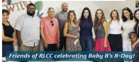
Friends of RLCC celebrating Baby B's B-Day!