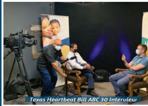
Texas Heartbeat Bill ABC 30 Interview