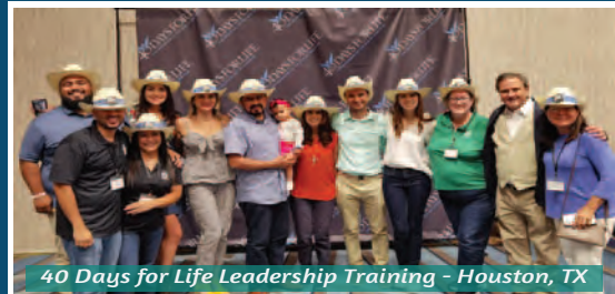
40 Days for Life Leadership Training - Houston, TX