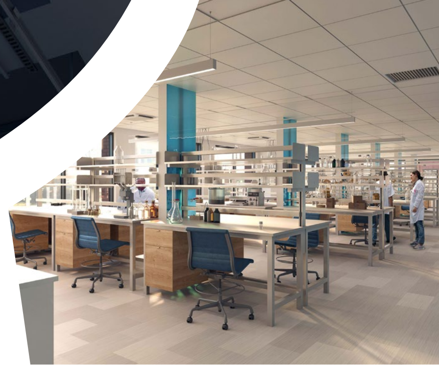
OUTFITTED LAB SPEC SUITE