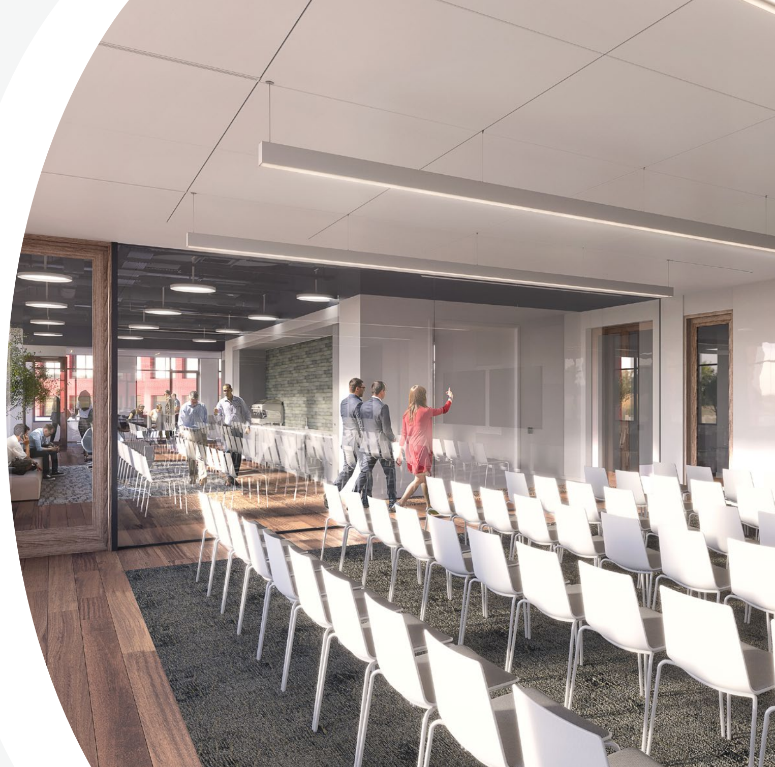
..... FULLY RENOVATED CONFERENCE FACILITY .....