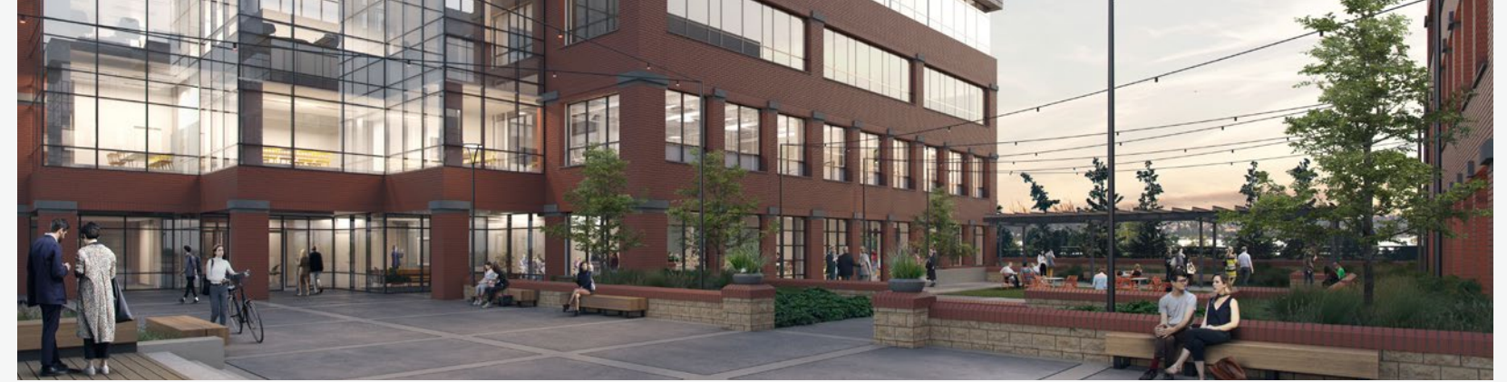
WEST COURTYARD VIEW OF ELLIOTT BAY