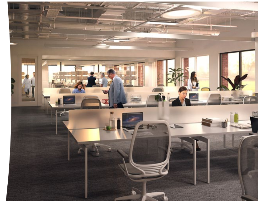
FLEXIBLE OFFICE-TO-LAB SPEC SUITE