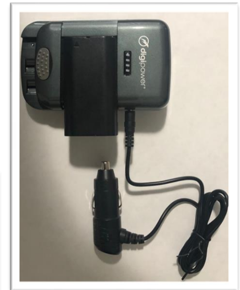
Or with provided DC Adapter