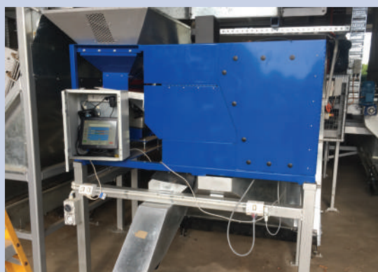
The newly installed colour sorter, which rejects any discoloured NIS, reduces the requirement for manual sorting

RFM management has reported that performance of the completed upgrades to date have outperformed expectations, with throughput capacity double that of the previous system.