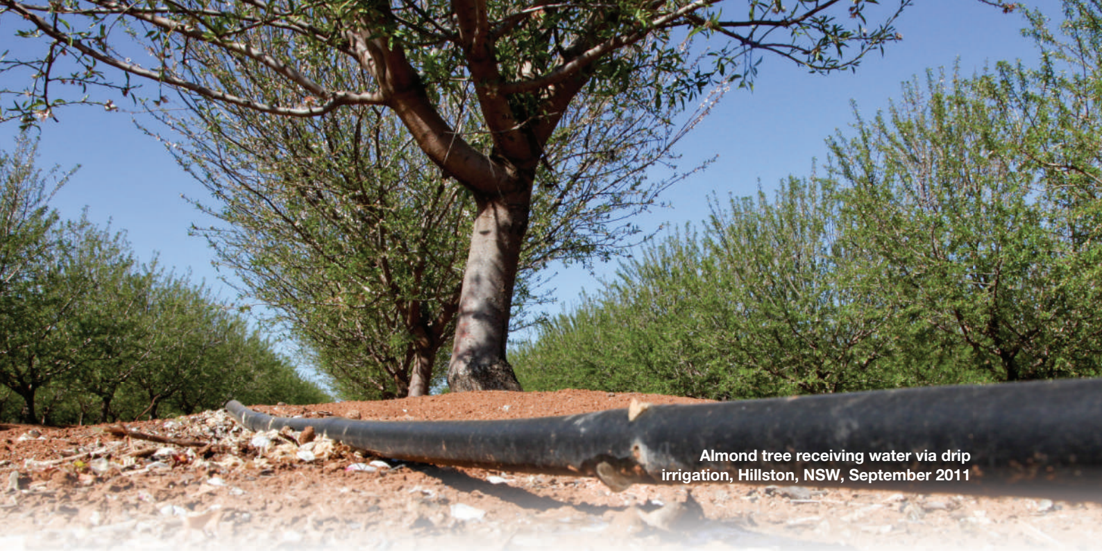
Almond tree receiving water via drip irrigation, Hillston, NSW, September 2011

As at 31 December 2016, RFF held water entitlements representing a fair value of $152.7m, with the majority held in the Southern Murray-Darling Basin. RFF also holds water rights in the Fitzroy Basin and Burnett River Catchment in central and southeast Queensland. Table 1 outlines RFF's water assets as of April 2017.