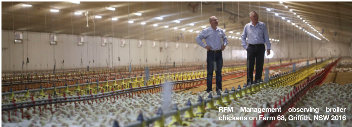
RFM Management observing broiler chickens on Farm 68, Griffith, NSW 2016