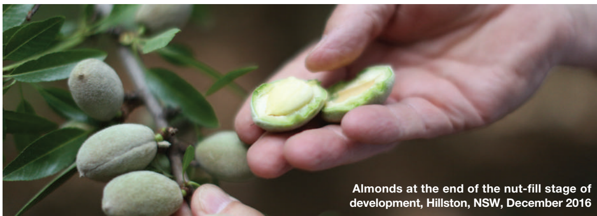
Almonds at the end of the nut-fill stage of development, Hillston, NSW, December 2016