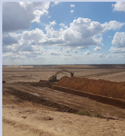
Earthmoving equipment constructing the new water storage area, April 2017

Lynora Downs sits in a water catchment area totalling around 5,000 kms 2 and one of the advantages of the property is that it is located upstream in the water catchment area, receiving flows before any other property. It is planned to complete the development by the end of November, with most of the property's 638 mm of rainfall expected to be received over the summer months.