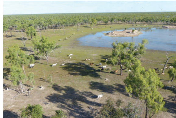
Brahman cattle grazing near a watering point, Mutton Hole, QLD, August 2016

Energy, the second limiting factor, is absorbed from grasses, primarily through the fermentation process occurring in the rumen. This process is maintained by microbes that reside there in incredible numbers and diversity. For each millilitre of rumen fluid there are around 10 billion bacterial cells of 200 differing species, plus protozoa, much larger but less numerous single cell organisms. This vast army of microbes, held in a solution of saliva supplied at 125 litres per day, process plant cellulose into sugars and volatile fatty acids that create energy to sustain this process and enable animal growth or weight gain. This complex process is the consequence of a symbiosis between the host animal and the vast microbial population residing within it, and is an example of the diffusion and interconnection of life described by Humboldt and Darwin.