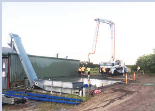
Construction work on stage 1 of the de-husking shed upgrade

In addition to this upgrade, RFF has funded the automation of irrigation systems at the Swan Ridge and Moore Park orchards. This allows for more accurate control and monitoring of irrigation from a central location. This upgrade benefits growers through the reduction of labor costs, improvements in water efficiency and the ability to use off-peak electricity.