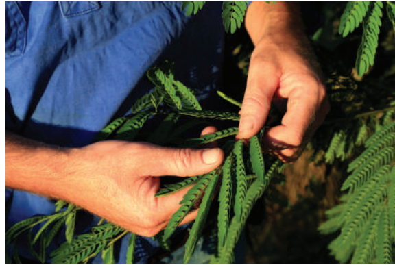
Leucaena (a legume), Rewan, QLD, August 2016

Studies using GPS trackers attached to cattle have shown that on average cattle will stay within 1.2 km of a water source, and that up to 80% of grazing occurs within 2 km of that point.