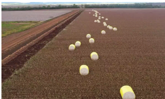
Baled raw cotton on Lynora Downs, ready for delivery to Queensland Cotton for ginning, March 2017