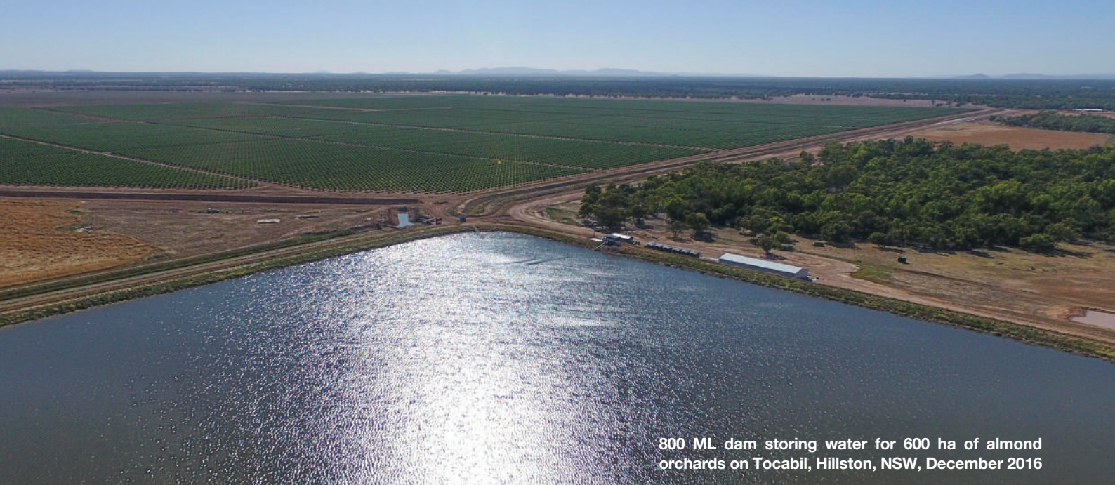
800 ML dam storing water for 600 ha of almond orchards on Tocabil, Hillston, NSW, December 2016