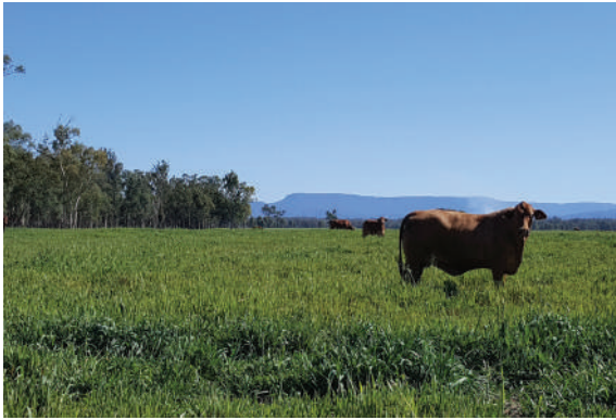
Cattle grazing on forage crops, Rewan, QLD, August 2016