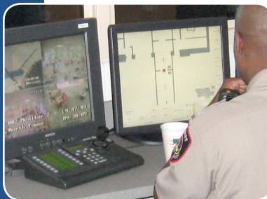
TOUCHSCREEN EQUIPPED CONTROL CENTER

Creative Technologies has been manufacturing electronic security control systems for over 20 years. Recently, we branded our systems "Secured State". Secured State's systems are built using common sense principles designed for reliability and maintainability. System engineering is accomplished using Secured State's Right from the Start software collaboration tools. Software is developed using standard software development products. Computers use Intel® architecture for reliability and continuous operation. Omron, a multi-billion dollar, global organization, provides our Programmable Logic Controllers.