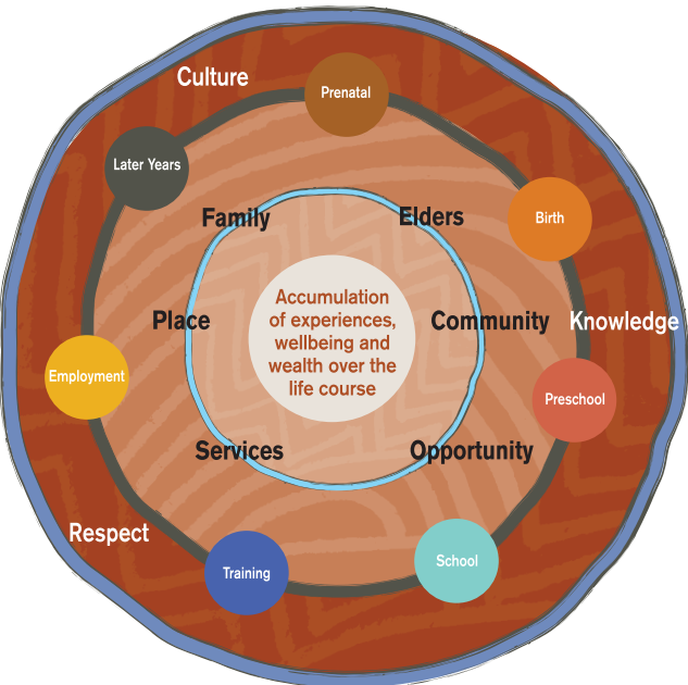
The Life Course Approach to Aboriginal Affairs in Victoria

The Victorian Aboriginal Affairs Framework 2013-2018 is the Government's plan for closing the gap in Victoria by 2031, working in partnership with Aboriginal communities, service providers and the business sector.