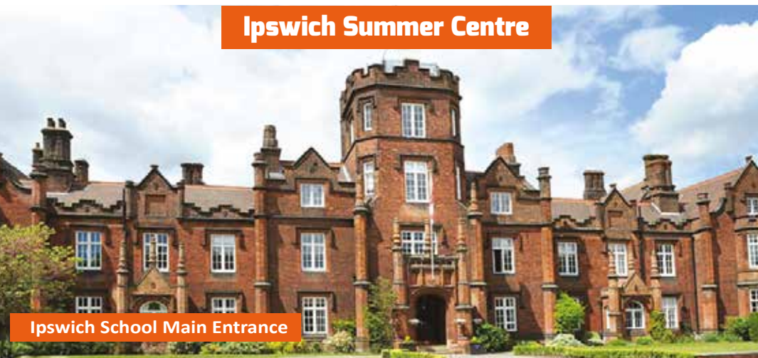
Ipswich School Main Entrance