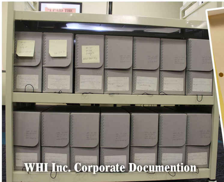
WHI Inc. Corporate Documentation

CITATION: Document Title. Document Date. Records from the Board of Directors of the War Hemp Industries, Inc., The National Archives and Records Administration (NARA), Kansas City, MI. 1943 - 1947.