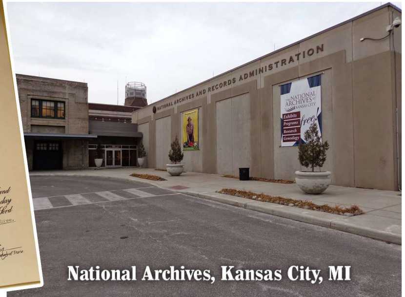
National Archives, Kansas City, MI