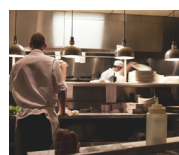
Restaurant & Food production,