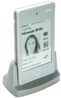
Charging Brick single charging (USB-C) OrderCode: X-H-C1-1.0