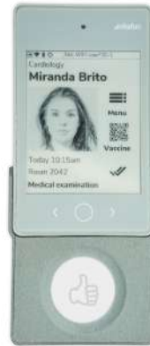
Apple Airtag module OrderCode: X-H-A2-1.0