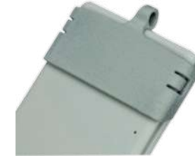
Lanyard-Clip OrderCode: X-H-H1-1.0