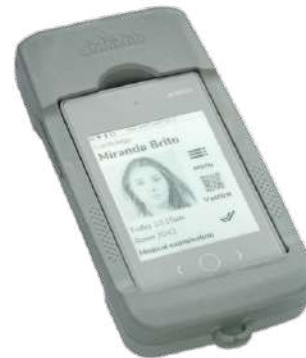
QR- Scanner for scanning 1D/2D codes OrderCode: X-H-S1-1.0