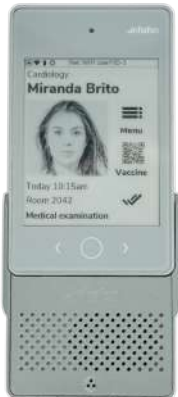
Audio Module for Voice messages and extra loud alarm sounds OrderCode: X-H-A1-1.0