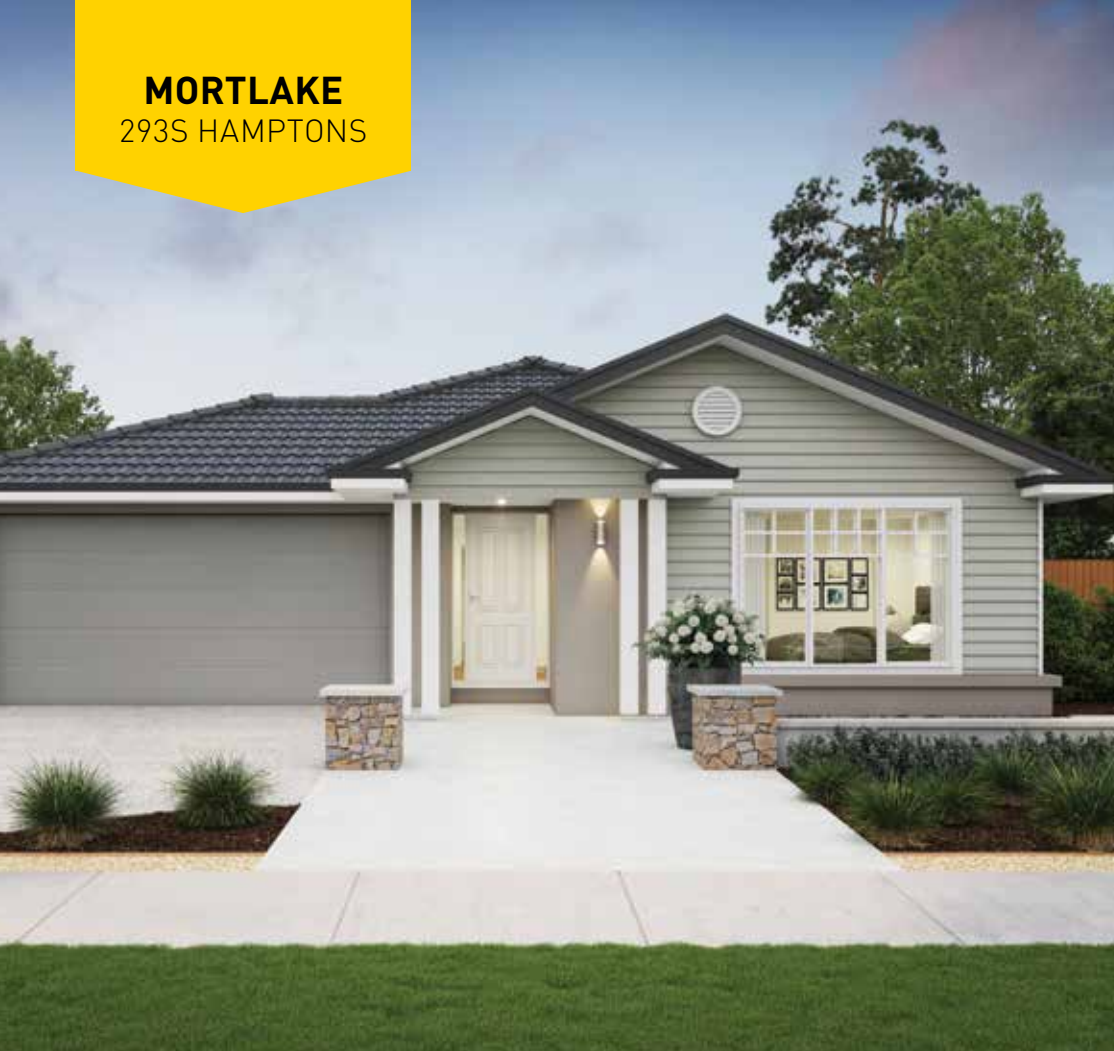
MORTLAKE 293S HAMPTONS