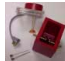
TCVDE ASTM D1816