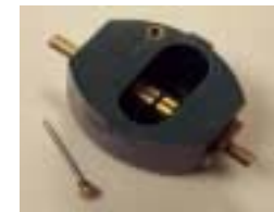
TCDE ASTM D877