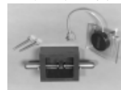
TCCE90 ASTM D1816 and ASTM D877