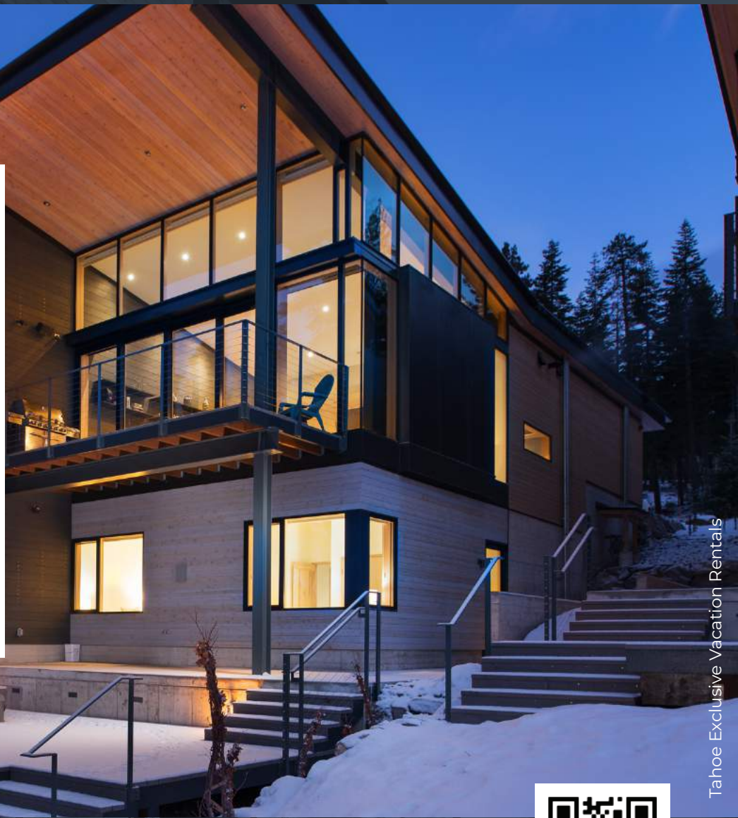
Tahoe Exclusive Vacation Rentals