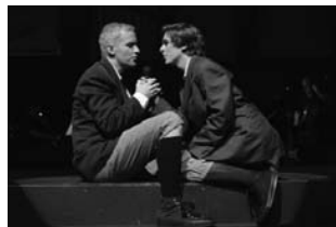
DS REWIND! Spring Awakening