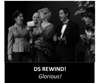
DS REWIND! Glorious!