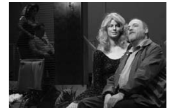
DS REWIND! Best Little Whorehouse in Texas