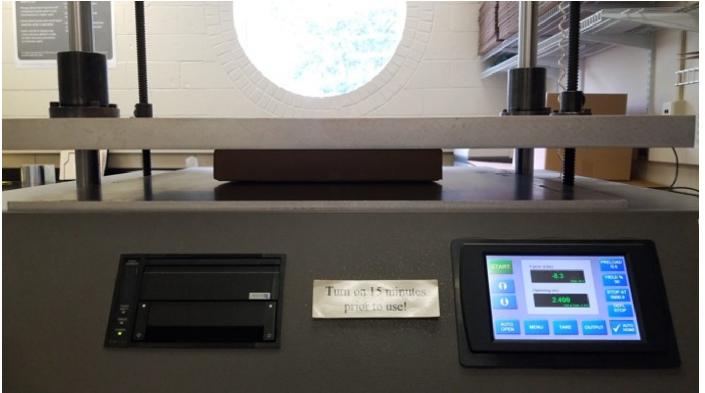
Figure 2 – Face 3 (or 1)