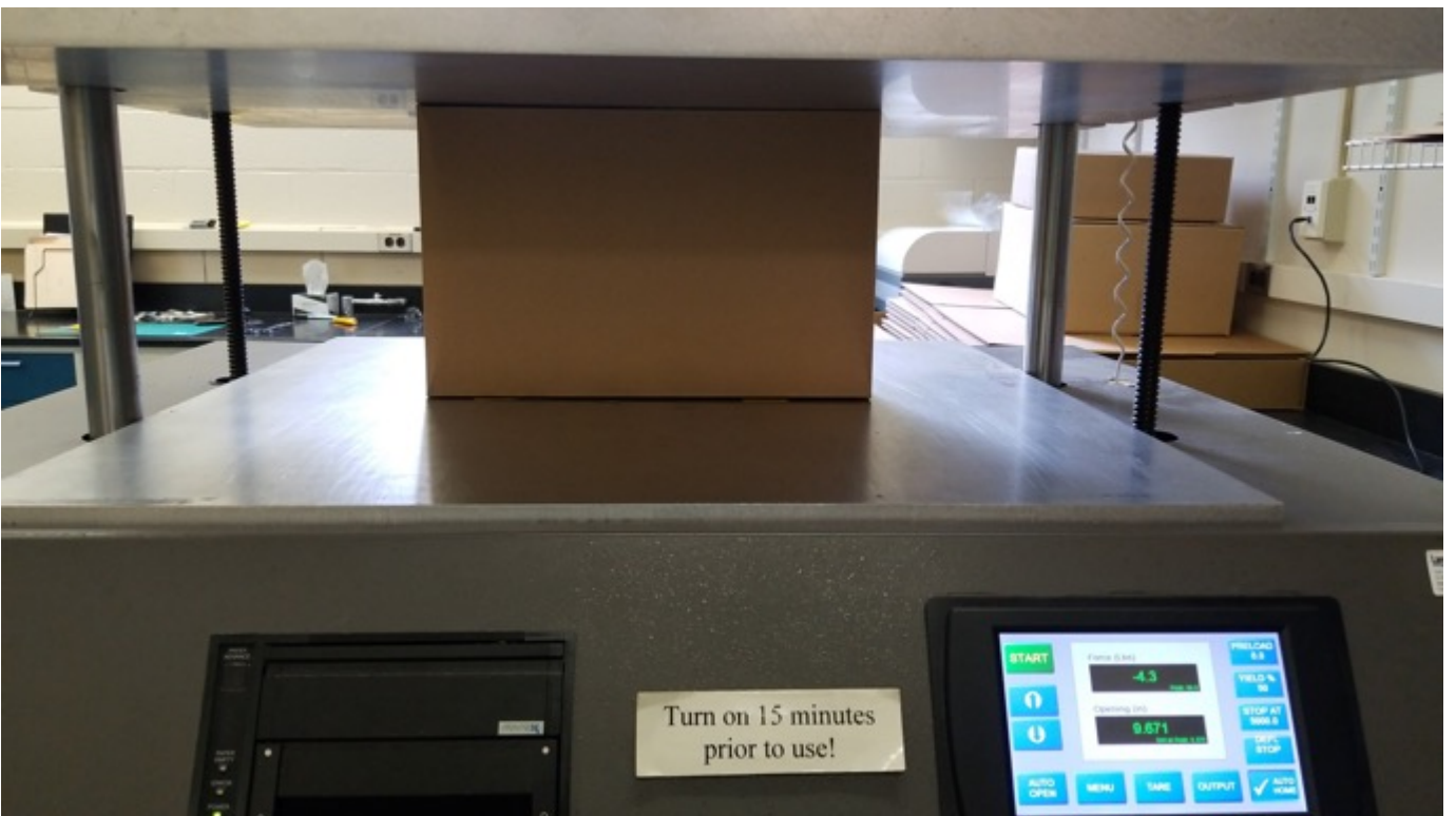
Figure 3 – Face 4 (or 2)