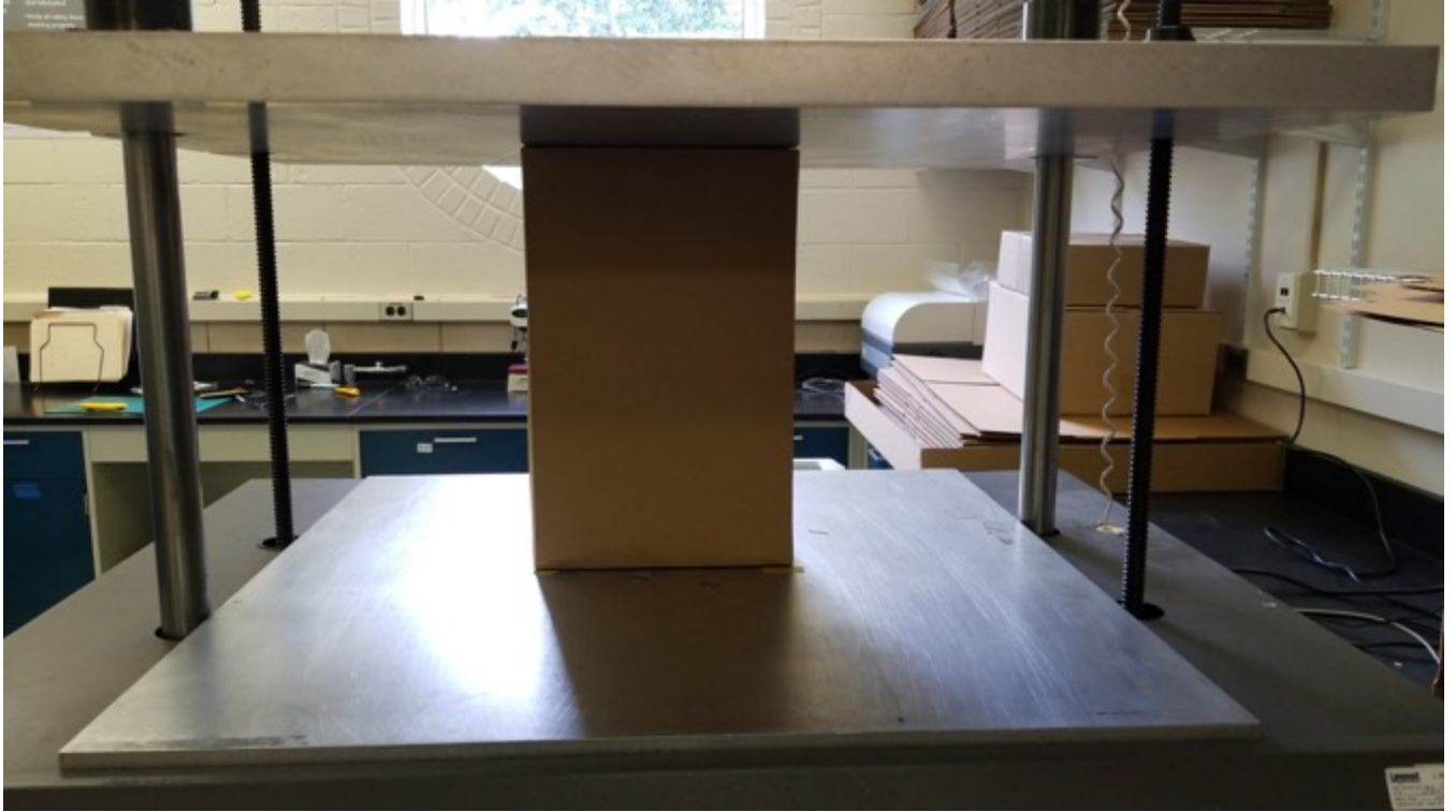
Figure 4 – Face 5 (or 6)