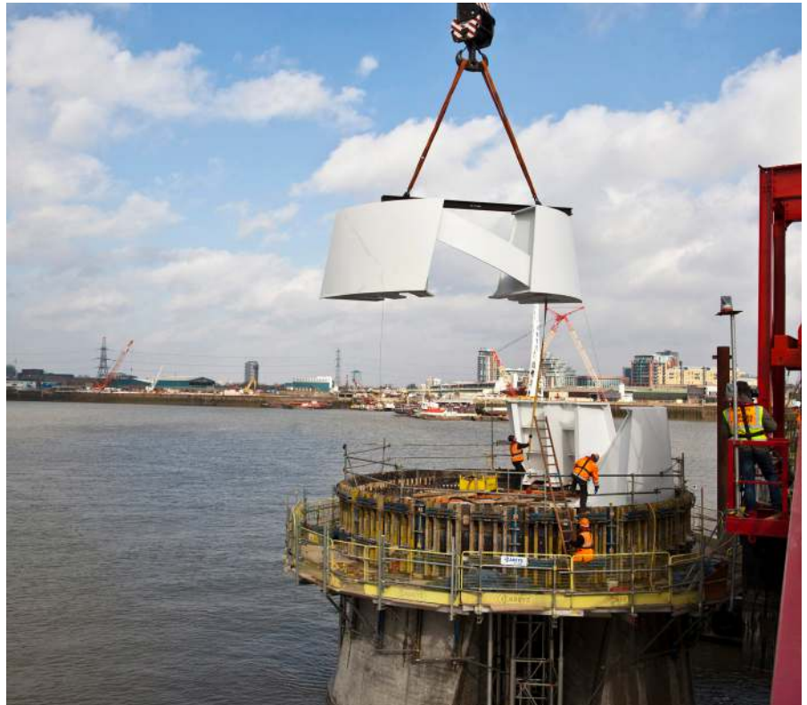
London Cable Car – South Tower Steel Work Installation

Find out more about Careys here: www.careysplc.co.uk .