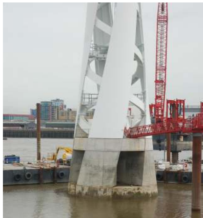
London Cable Car – South Tower Base Complete

“ It is this simplicity that is Asta Easyplan's big gain over other software like Microsoft Project, you can put together a usable, effective programme simply and in next to no time. ”