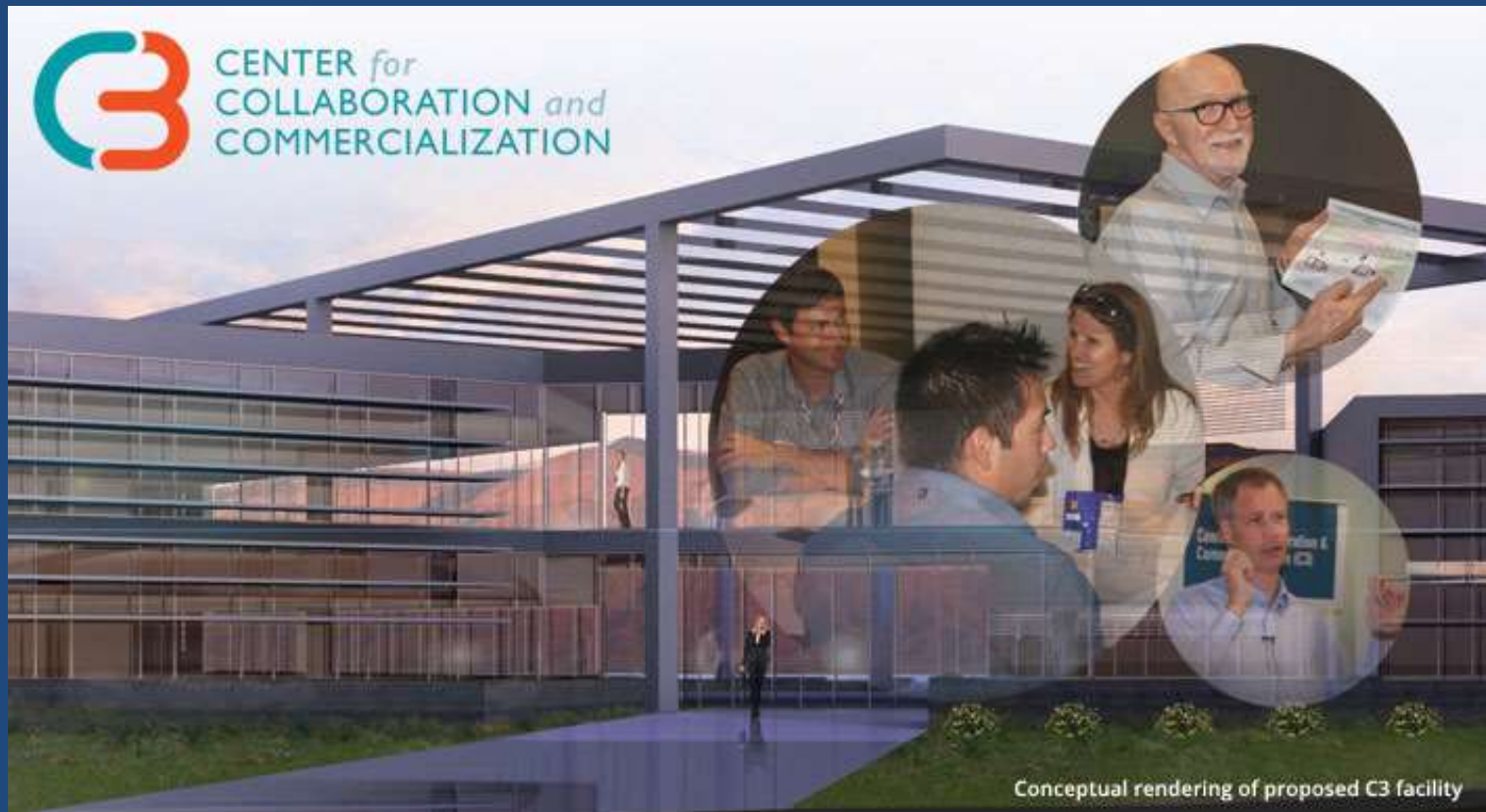
Conceptual rendering of proposed C3 facility