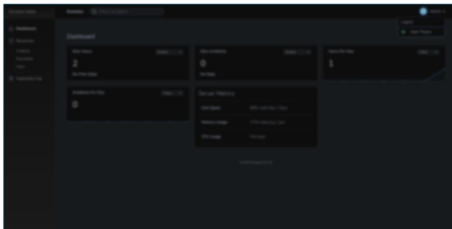
DroneSec Notify Threat Intelligence Platform (TIP) - Dark Mode

Its webinar week this week at DroneSec HQ with a live presentation for Sphere Drones aimed at drone organisations ( recording located here ) and a more technical-based presentation aimed at security participants of the upcoming virtual conference ComfyConAU on Friday 7:30pm AEST . It's a great time to focus our efforts online, when the team was initially meant to be stretched between Norway, Cambodia and Singapore for working groups, conferences and talks this month.