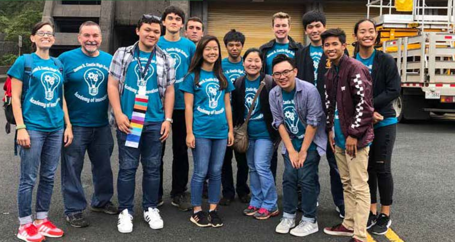
« Engineering Pathway Students tour the HB Harano Tunnel.