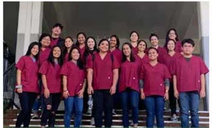
« Medical Pathway students are dedicated to their Pōhāi/Nānā i kīnentele.