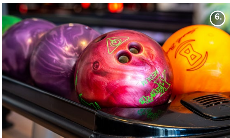
1.The Palms 2.Bungalows 3.Lounge Deck 4.The Left Deck 5.Ocean Alfresco 6.Bowling Lanes