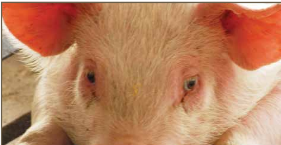
REDDENED, CRUSTY EYES