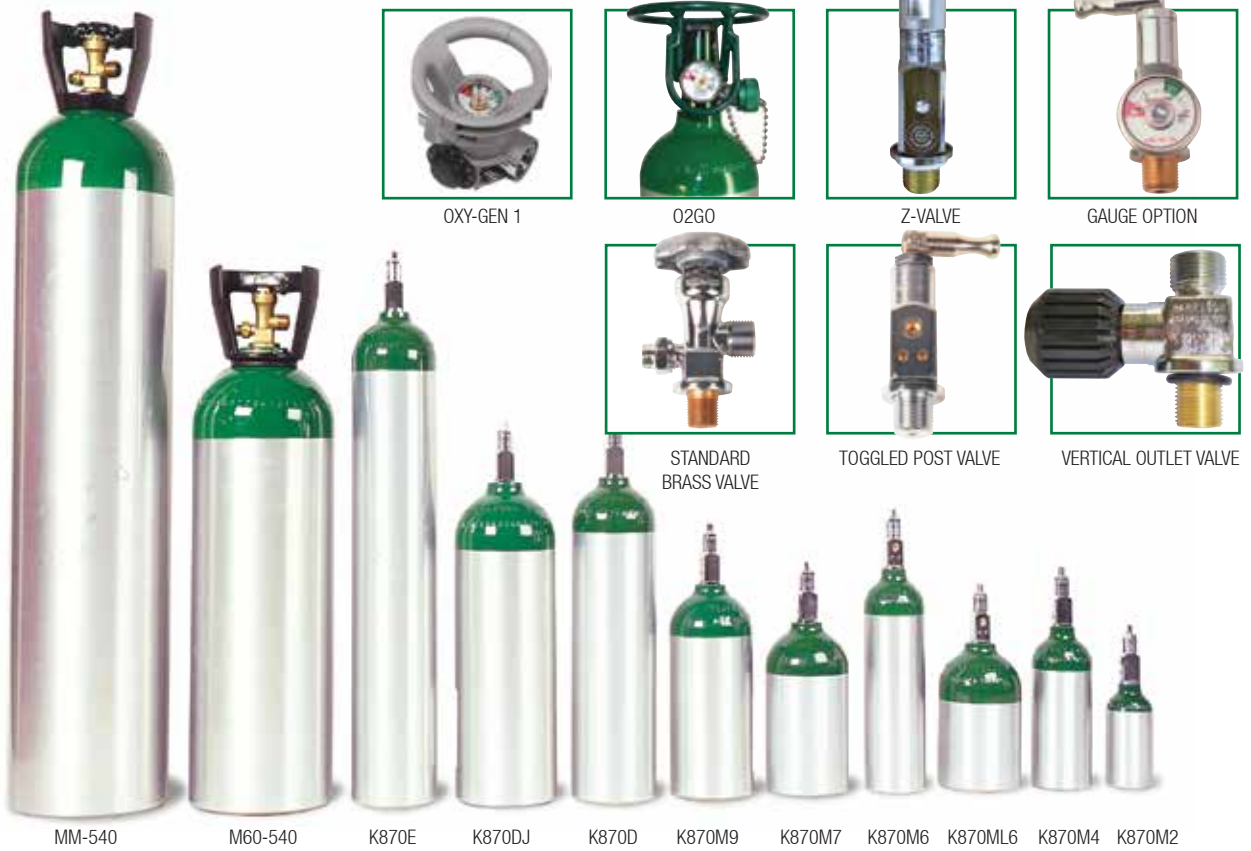
MM-540 M60-540 K870E K870DJ K870D K870M9 K870M7 K870M6 K870ML6 K870M4 K870M2