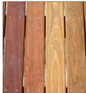
TIMBER DECKING - SPOTTED GUM