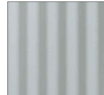
COLORBOND ROOF - SHALE GREY