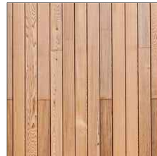
WEATHERTEX TIMBER CLADDING