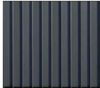
COLORBOND CLADDING - MONUMENT