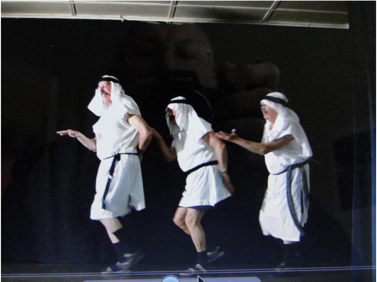
Not exactly Wilson, Keppel and Betty but near as damn it

Without any Christmas Party pictures this year to look back to, we thought we would show a few of past occasions starting with the incredible 3Daves in 2013