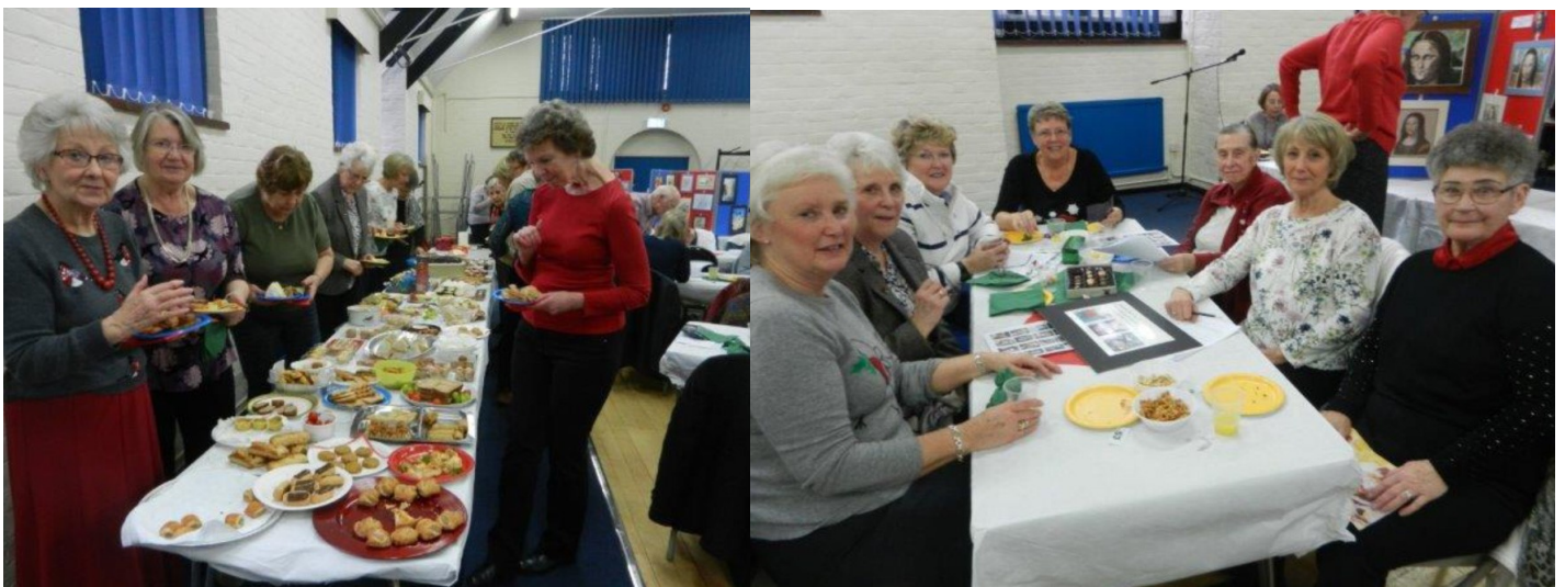
These pictures and the following pages are recent events and somewhat Dave-less