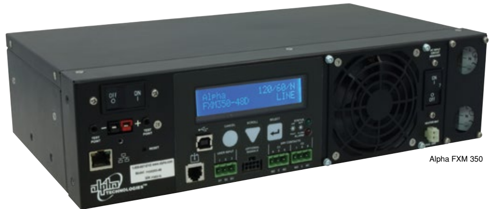
Alpha FXM 350