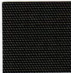
*WTY81 Chocolate Brown