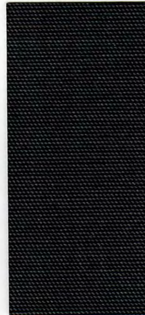
WTY24 Black Weathertyte® PLUS