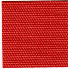
*WTY56 Paris Red