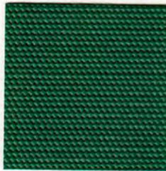
WTY6 Pool Green