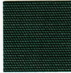
WTY5 Forest Green