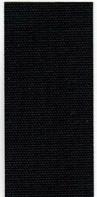
*WTY24L Black Weathertyte® PLUS Lite

**Only stocked in Black Other colors available by the roll