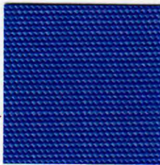
WTY416 Pacific Blue