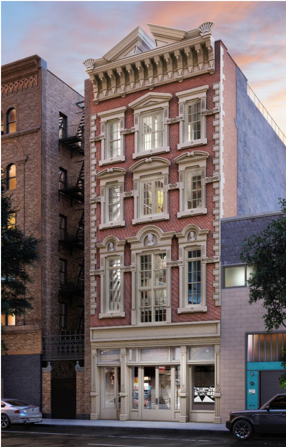
Rendering: 74 East 4th St.

La MaMa's historic, landmark building at 74 East 4th Street is undergoing an urgently needed complete renovation and restoration to preserve the historic façade, create building-wide ADA accessibility, and provide much needed performance, exhibition and community space for decades to come.