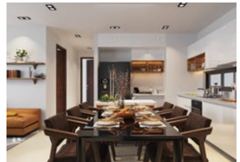
Dining and Kitchen