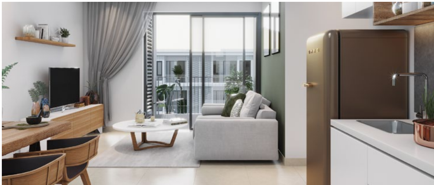
Living, Dining & Kitchen