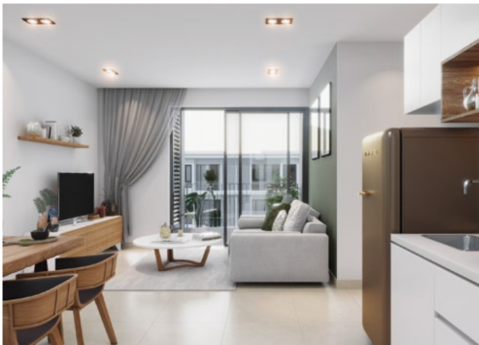
Living, Dining & Kitchen