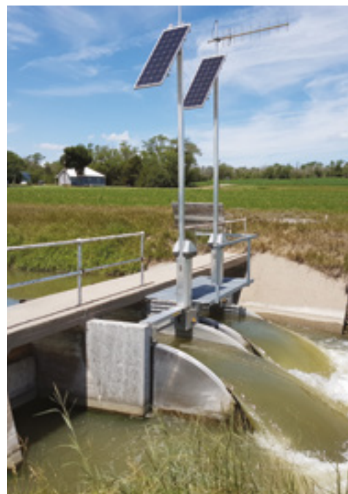
Automated water-tight FlumeGate structure located along the Cambridge Canal.

Automation and efficiency improvement are investments that all irrigation districts should look into, especially if they are in a water-short basin where the value of water is high.