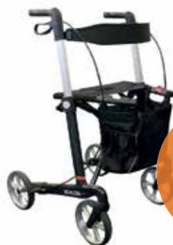
Walking Aids from sticks to walkers