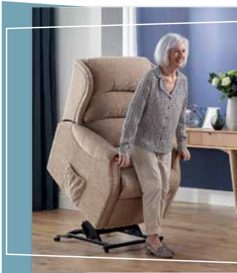
Riser Recliners from £589 ex vat

To find out more visit clearwellmobility.co.uk/motability-scheme/