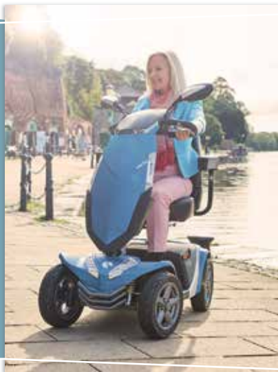
Mobility Scooters from £799 ex vat