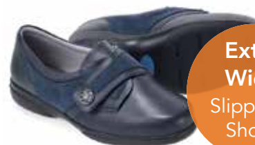
Extra Wide Slippers & Shoes