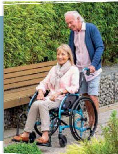
Wheelchairs from £159.99 ex vat

To view our full range of products on offer, request your FREE Brochure at clearwellmobility.co.uk/brochure-request