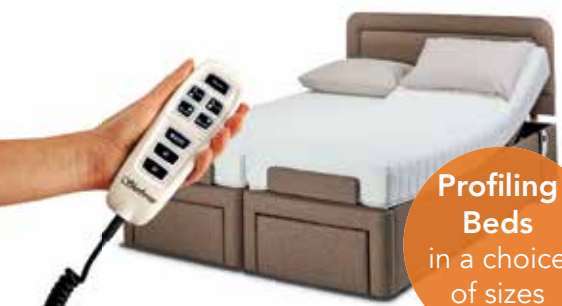
Profiling Beds in a choice of sizes

To view our full range of products on offer, request your FREE Brochure at clearwellmobility.co.uk/brochure-request