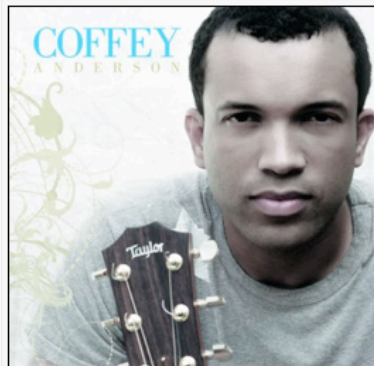
Released on September 28th, Coffey Anderson's new self-titled album features songs that mix pop, country, Christian and soul.

Posted by Candace on Oct 01, 2010 | 2 Comments