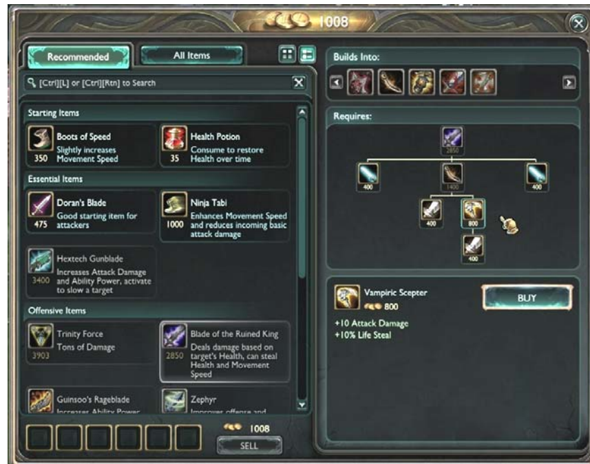
Figure 5.4 – Recommendations in LoL Mitigate Opportunity Cost and Paradox of Choice

On the other hand, consider the award winning game, League of Legends™ (LoL). Here, designers also had to contend with a wide array of player options for item and weapon upgrades. Like Fate™ and Titan’s Quest™, these decisions can massively impact both the players’ experience and their chances of success. To mitigate this problem, LoL used two clever techniques. First, they provide recommended items as shown in Figure 2.6. These recommendations act as default options, which reduce the perceived number of choices and provide an easy out when players attempt to simplify the decision (Schwartz, 2004). The game then evolves in such a way that players can really only afford two or three items at any given time. This further simplifies the decisions. As players learn more about the game, they can bypass the recommendations altogether, but whenever they try a new character, the recommendations are always available as a safety net. Second, LoL items have very little permanence. Items are reset after each game (~30-45 mins). This eliminates almost entirely the problem of opportunity cost and thus reduces anxiety.