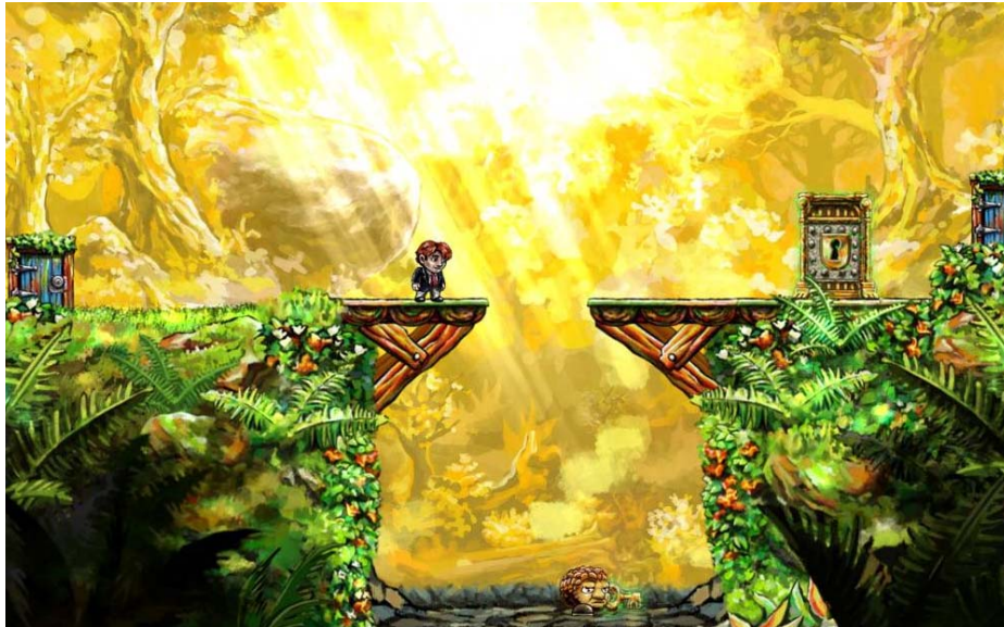
Figure 5.8 – In Braid™, Learning About Time Is Core To The Fun

various aspects of time: faster, slower, backward, and forward. Blow wants players to think about and learn about time in a fundamental way. Figure 4.1 shows a scene where players must manipulate time to solve a puzzle. They must fall into the pit, defeat a monster, get the key, and then reverse time back to before they fell into the pit. In this puzzle, the key is immune to time reversal, and the player will be back on the bridge, but holding the key. In the picture, you can clearly see that there is no way out of the pit. The only solution is for the player to explore, learn about, and apply the complex manipulation of time that is the fundamental concept (i.e., learning objective) of the game. Time is the lesson and is also the core mechanic of the game.