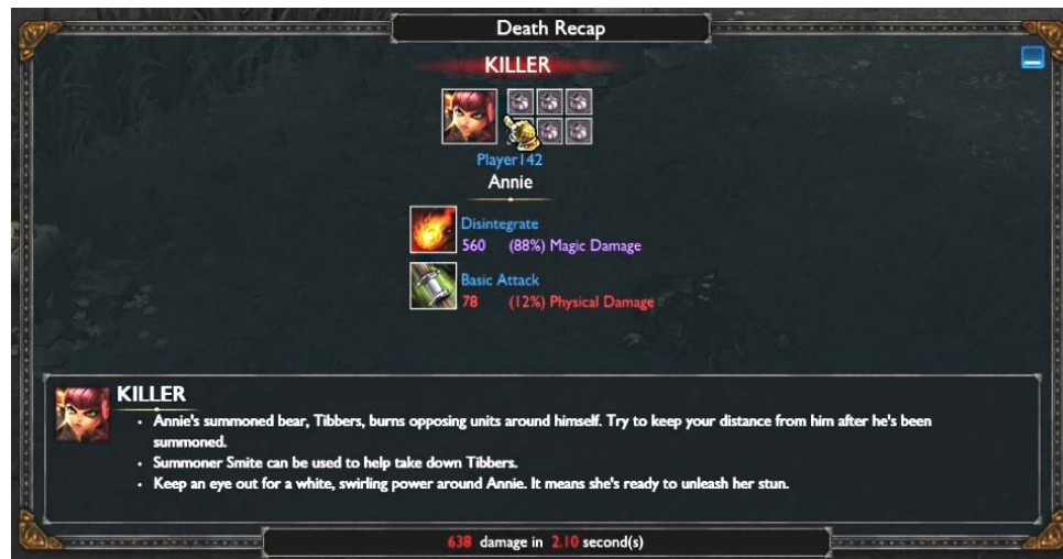
Figure 5.6 – A Moment of Reflection After Death in League of Legends™

The score screen is not the only way to use reflection in games. In fact, because of its dynamic, nearly instantaneous nature, the game medium has incredible potential. As an example, consider the screen shot of League of Legends™ (LoL) in Figure 2.5. Here, the player has been slain by opponents and must wait 30-60 seconds before respawning and getting back into the action. This cooling off period affords an opportunity for reflection. While dead, players can see a “death recap” that gives immediate feedback on what happened. After they respawn, the players can apply what they have learned by purchasing defensive items or changing tactics with their team. In this instance, the player should realize that most of the damage was from magical sources – little Annie packs a punch! LoL turns an interruption in game play (being dead) into a moment of reflection that helps players improve their performance and maintain flow.