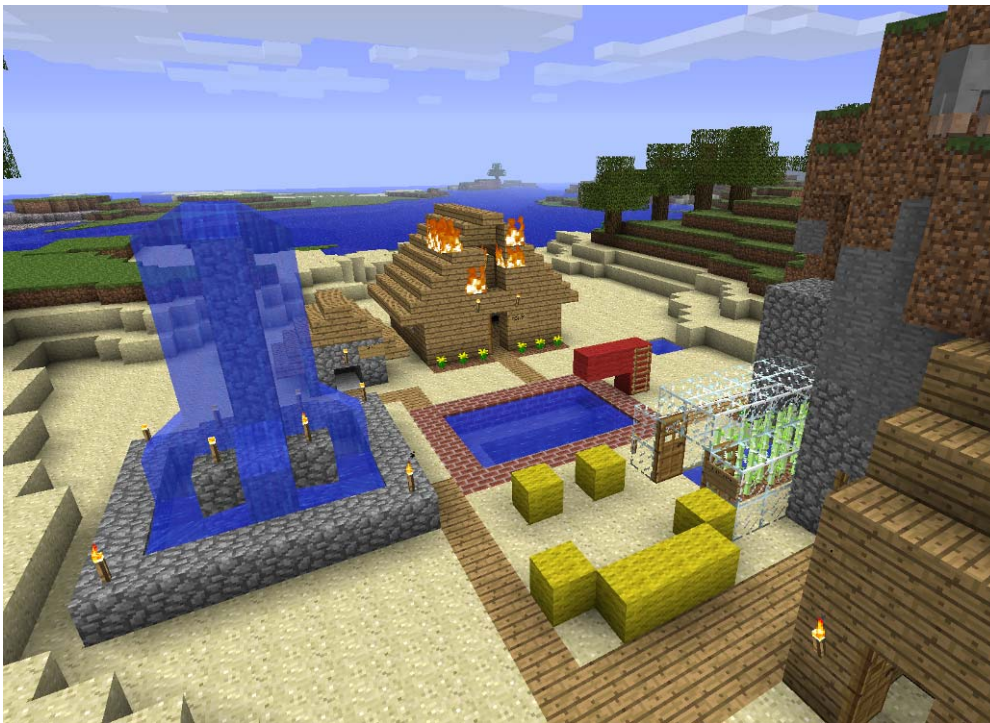
Figure 5.2 – Player-Driven Tasks in Minecraft™

Minecraft™ is an example of a sand-box type of game. Figure 2.2 shows a scene where the player has decided to craft their own beach town. There is a town hall, a set of apartments in the mountain wall, an enormous central fountain, swimming pool, sugar farm, and a little smiley-face meditation garden. All of this was created without any explicit or implicit tasks. The mechanics allow players to destroy, harvest, and build almost anything they can imagine: floating castles of glass, rivers of lava, railroad roller coasters, death traps, or functioning musical instruments. Alternately, players can build nothing at all. Their goal may be to wander around exploring the limitless landscape. Minecraft™ demonstrates how games use player-driven tasks and emergent gameplay to create flow.