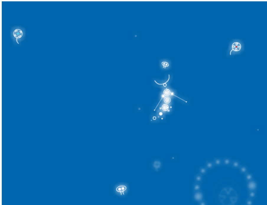
Figure 5.5 - fLOW With Real-Time User Adjustable Difficulty