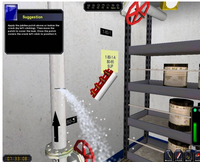
Figure 5.3 – Use of Feedback in Navy's Damage Control Trainer

of feedback at the same time. As the student interacts with the pipe and patch, the game provides immediate feedback by showing the patch attach to the pipe, by splashing water and changing audio cues when the spray is blocked, and by pushing the patch away when applied incorrectly on top of the rushing water. When the leak is patched correctly, the water flow changes to a drip. At the same time, the interface is also providing more general feedback about time elapsed, suggestions and hints, water flow, available inventory items, and success/failure progress indicators. All of the feedback in this scene focuses on the moment to moment actions of the player. It helps keep players in flow.