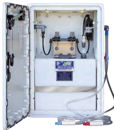
Wall Mount Activation System ™