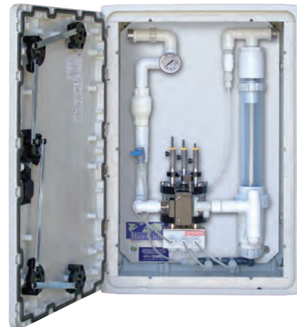
OLAS ™ Ti