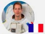
Thomas Posquet Astronaut European Space Agency