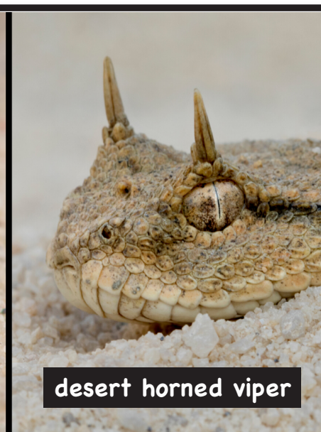
desert horned viper