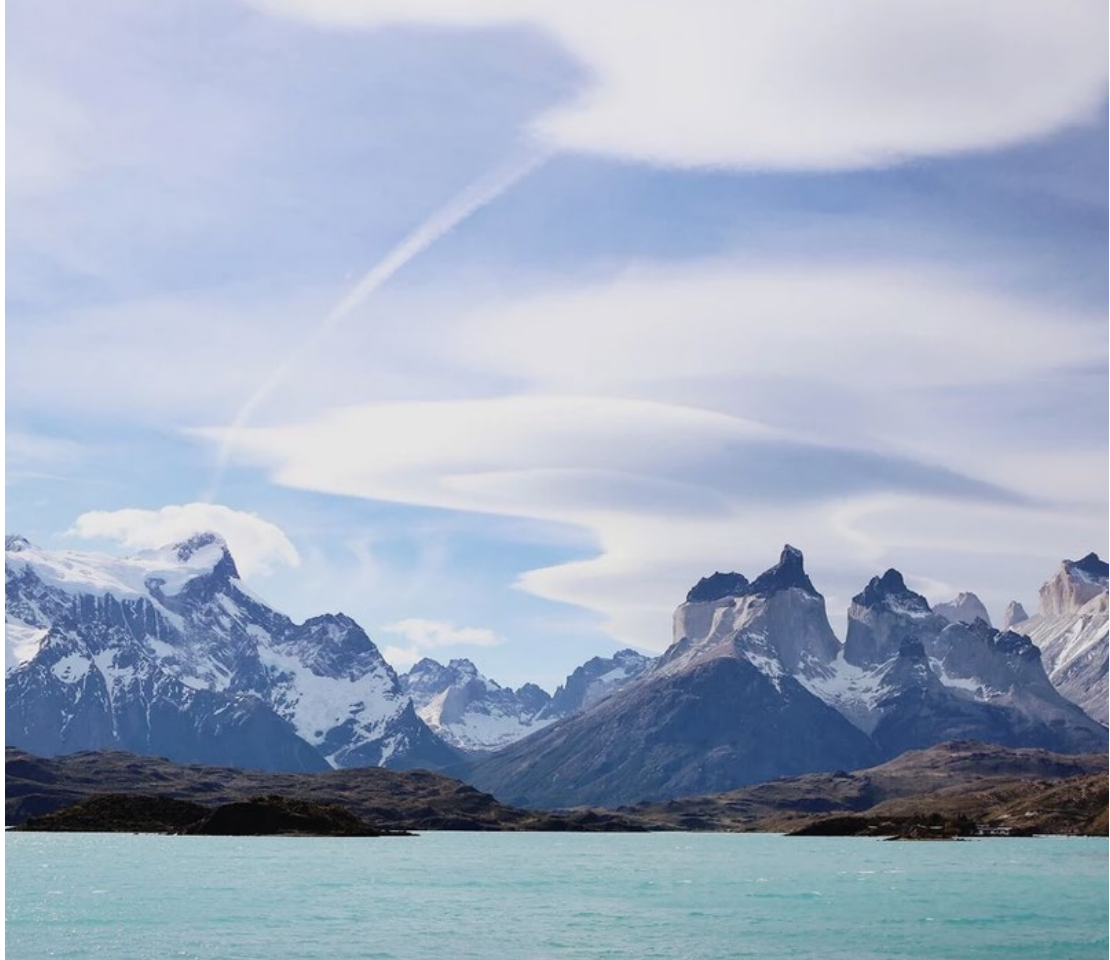
Torres del Paine National Park, a UNESCO Biosphere located an hour and a half away by car.