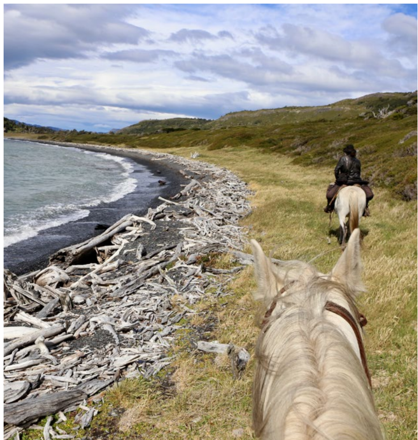
Riding along Misery Bay with our guide Cristian.