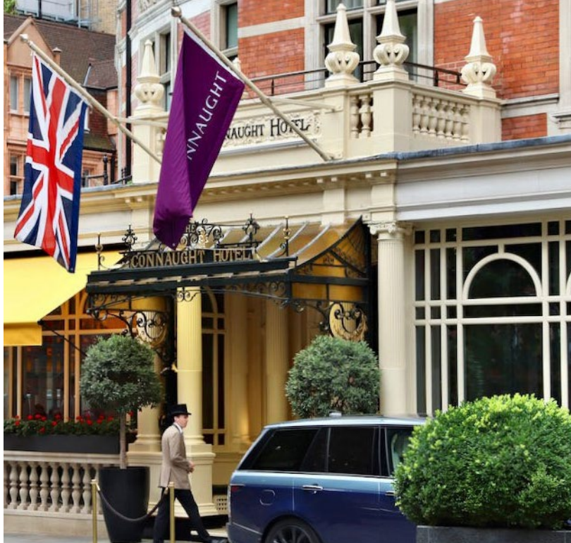
The Connaught Hotel at Carlos Place, Mayfair, London.