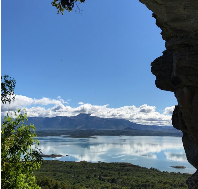
View of the mainland from a cave once used as an indigenous burial site.