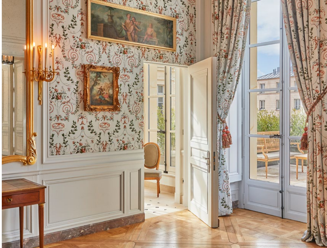
The Madame de Fouquet bedroom at Château de Versailles, Le Grand Contrôle.