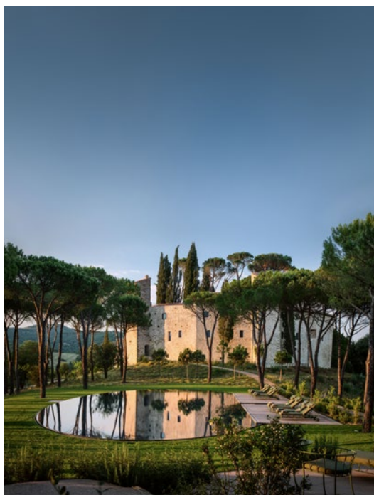
The serene pool and grounds of Hotel Castello di Reschio.